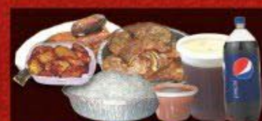
COMBO 6 $27.95 PORK CHOPS, HALF CHICKEN, PEPPER CHICKEN OR PEPPER STEAK