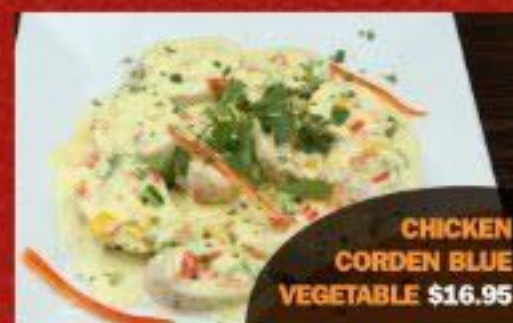
CHICKEN CORDEN BLUE VEGETABLE $16.95