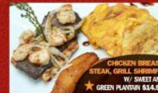
★ CHICKEN BREAST, STEAK, GRILL SHRIMPS W/ SWEET AND GREEN PLANTAIN $14.95