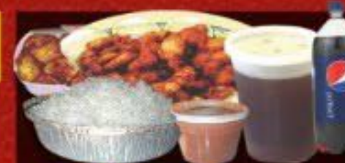
COMBO 5 $24.95 CHICHARRON DE POLLO, S/ HUESO BONELESS CHICKEN CHUNKS