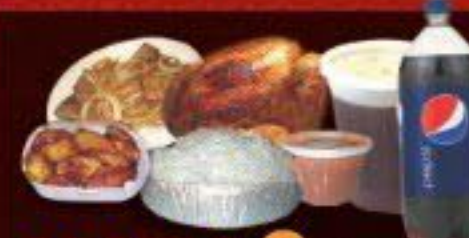
COMBO 8 $33.95 1 POLLO, BISTEC ENCEBOLLADO, ONE CHICKEN, STEAK,

ALL THIS PLATES COME WITH LARGE RICE, MEDIUM BEANS AND SWEE PLANTAIN, 32 OZ. ICED TEA OR 2 LT SODA