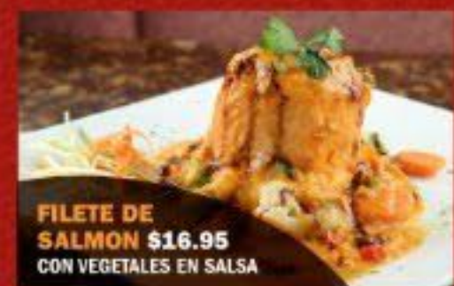
FILETE DE SALMON $16.95 CON VEGETALES EN SALSA