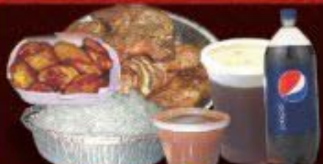
COMBO 3 $23.95 CHULETA (3PZ) PORK CHOPS (3 PCS)