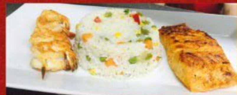
★ FILET SALMON, GRILL SHRIMPS W/ RICE $16.95