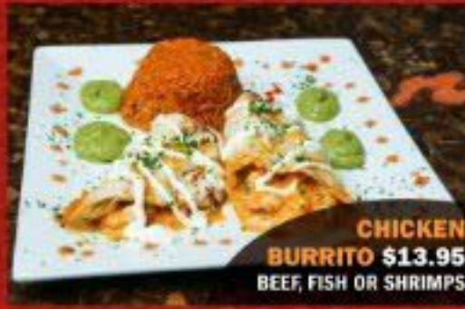
CHICKEN BURRITO $13.95 BEEF, FISH OR SHRIMPS