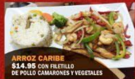
ARROZ CARIBE $14.95 CON FILETILLO DE POLLO CAMARONES Y VEGETALES