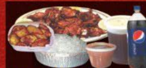
COMBO 4 $22.95 CHICHARRON DE POLLO, CHICKEN CHUNKS