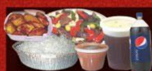
COMBO 2 $24.95 PEPPER CHICKEN OR PEPPER STEAK