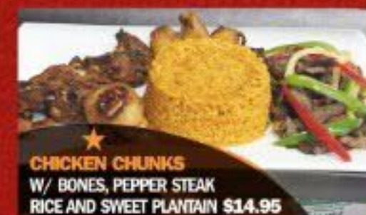
★ CHICKEN CHUNKS W/ BONES, PEPPER STEAK RICE AND SWEET PLANTAIN $14.95