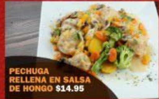
PECHUGA RELLENA EN SALSA DE HONGO $14.95