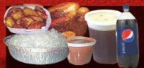
COMBO 1 $23.95 1 POLLO, 1 WHOLE CHICKEN