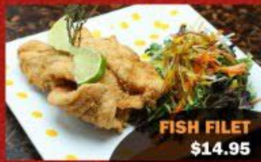
FISH FILET $14.95