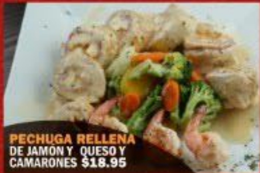
PECHUGA RELLENA DE JAMON Y QUESO Y CAMARONES $18.95