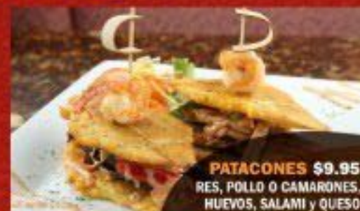
PATACONES $9.95 RES, POLLO O CAMARONES, HUEVOS, SALAMI Y QUESO